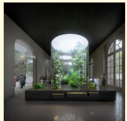
Images © Chatillon Architectes pour la Rmn – Grand Palais, 2022 / Doug&Wolf